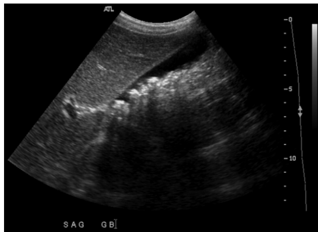
Figure 3. A 40-year-old woman with SC anemia presents with right upper quadrant abdominal pain. Ultrasound of the abdomen demonstrates numerous mobile, echogenic gallstones with dense posterior acoustic shadowing, consistent with pigmented gallstones.

Cholecystectomy is the most frequent surgery in patients with SCD, comprising almost 40% of the procedures on SC patients. 50 Some authors advocate early cholecystectomy in asymptomatic patients for several reasons. First, emergency surgery might lead to complications such as SC crisis, longer hospital stay, and long operative time required to remove a diseased gallbladder. 44,51 Histopathologic chronic cholecystitis does not correlate with clinical symptoms. 52 Furthermore, one study reported no serious complications in their patients undergoing elective cholecystectomy. 53 In addition, SC patients